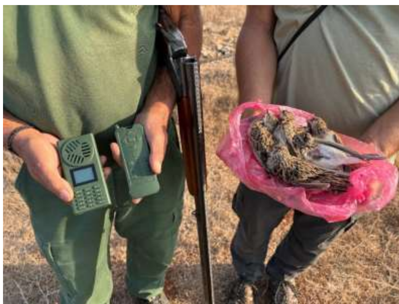
Picture 5: Illegal electronic caller used for hunting and seized by Game Wardens

In autumn 2025, CABS recorded 46 cases of illegal hunting and their reports led to the prosecution of 20 hunters for shooting protected species and/or using an illegal decoys - 19 in the Republic of Cyprus and one in the ESBA.